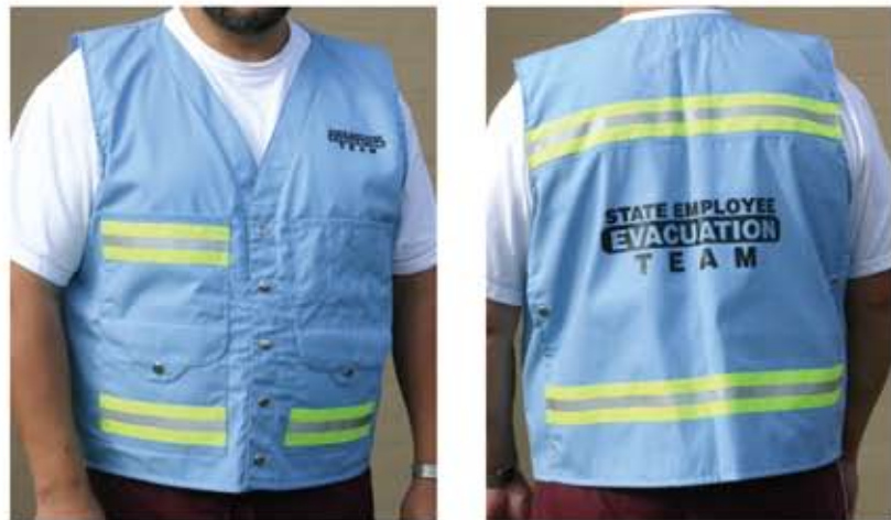
Light blue fabric with reflective safety stripes and snap front closure. Vest has 4 front pockets, 2 with snap, & snap cruiser pocket on back.