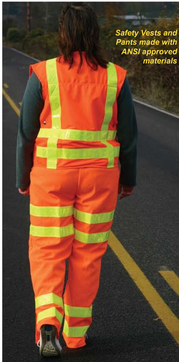
Custom modifications to Safety Wear are available